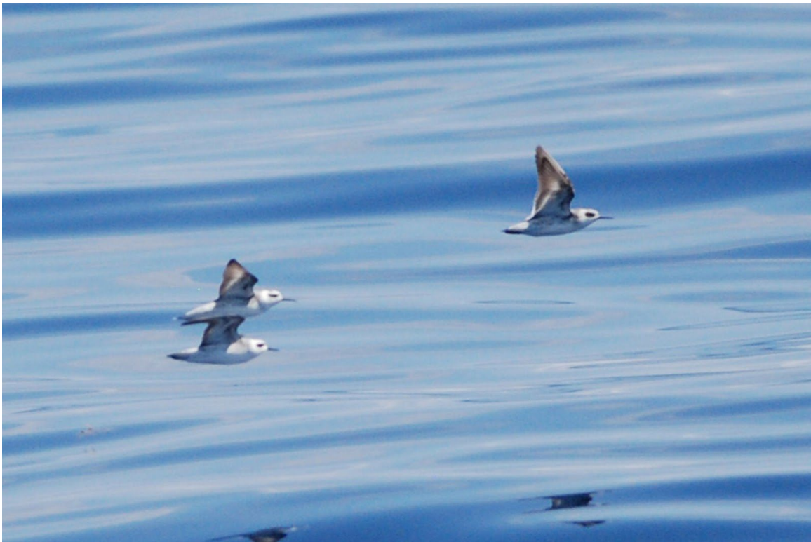
Group of 3; timestamp 1405