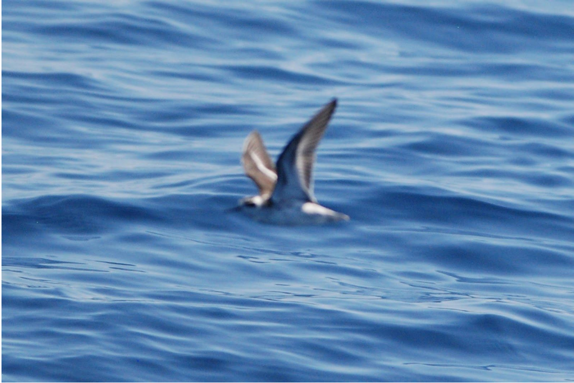
Group of 2; timestamp 1347