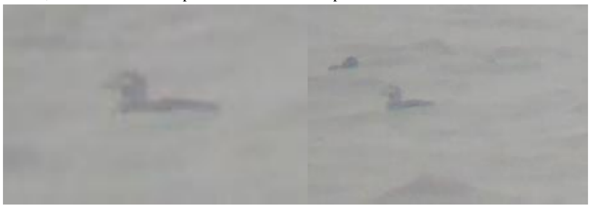
On 2/5, this individual was spotted 1.3 mi W of camps.

This individual—the same bird?—was spotted 45 minutes later 2.7 mi W of the camps. The bird was asleep when located, then woke up, preened, and flew E. I found a bird at 1.6 mi W of the camps a short while later, but was unable to get good looks as it was actively diving. The conservative route = 1 bird.