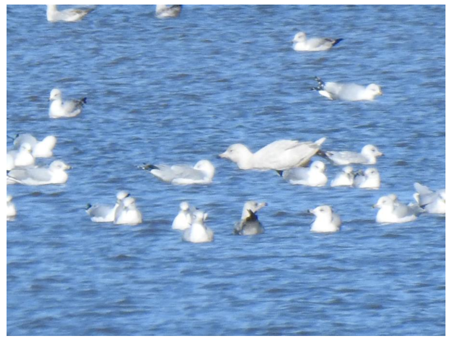
This photo from 11 Jan.