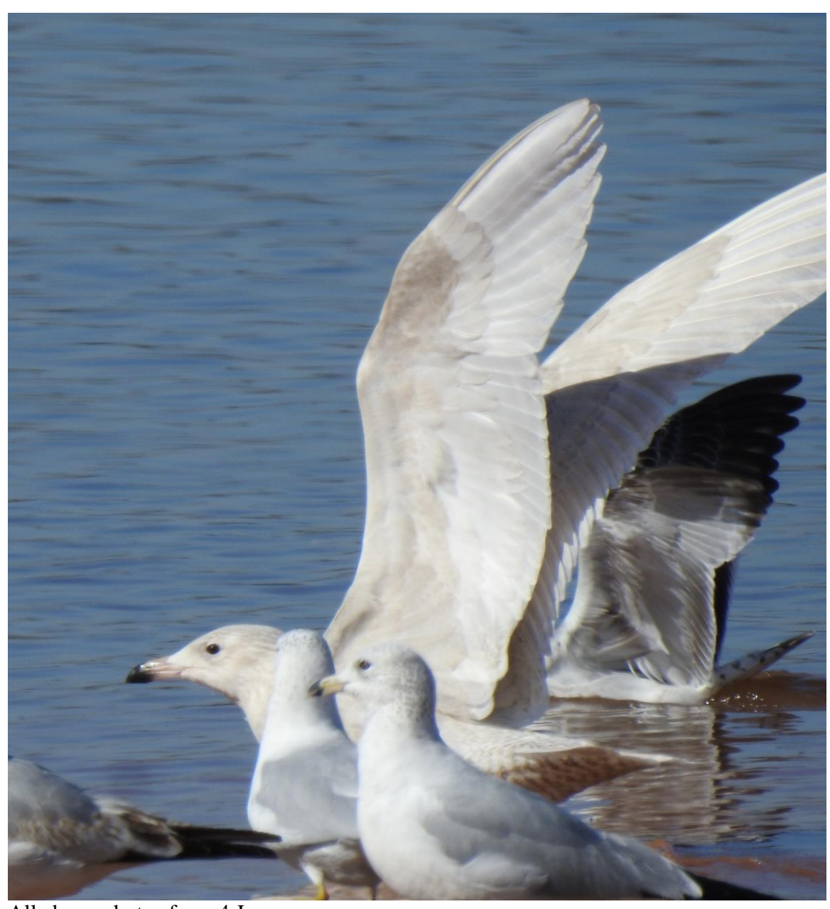
All above photos from 4 Jan