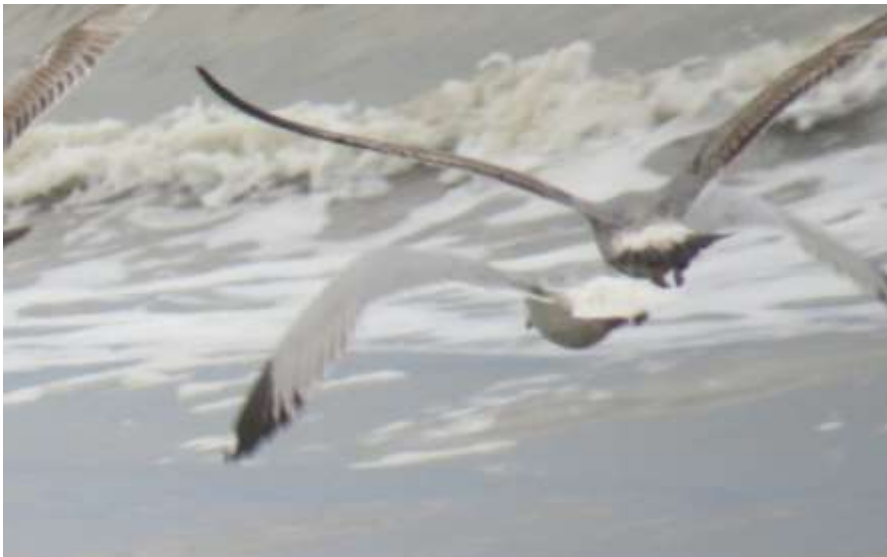
19. Previous experience with this species: several Louisiana, many out west.