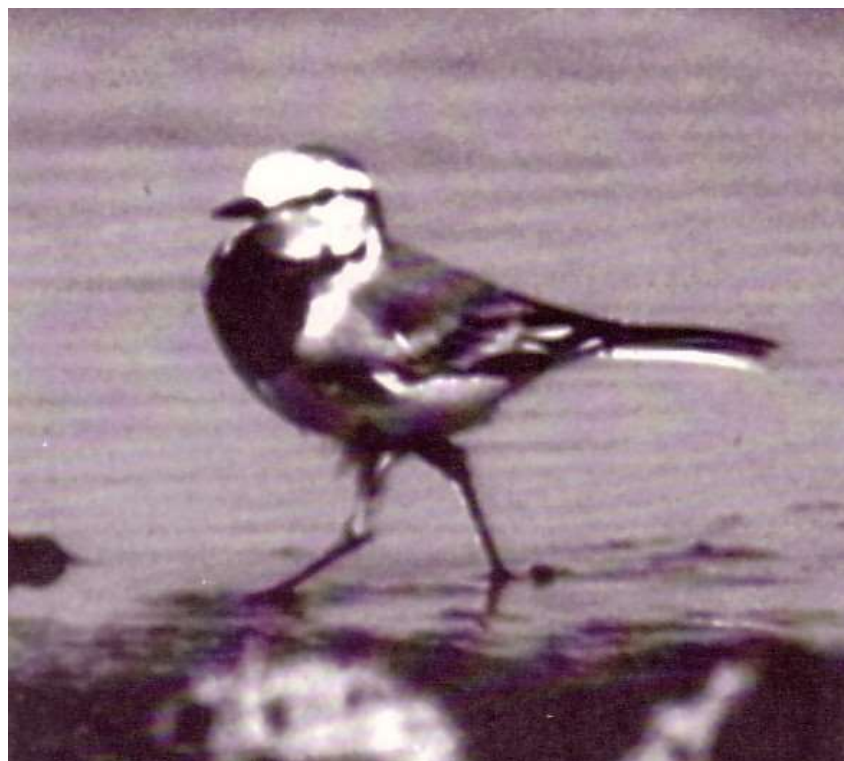
Adult male White Wagtail at Hackberry Ridge, Cameron Parish, Louisiana, 12 October, 1996.