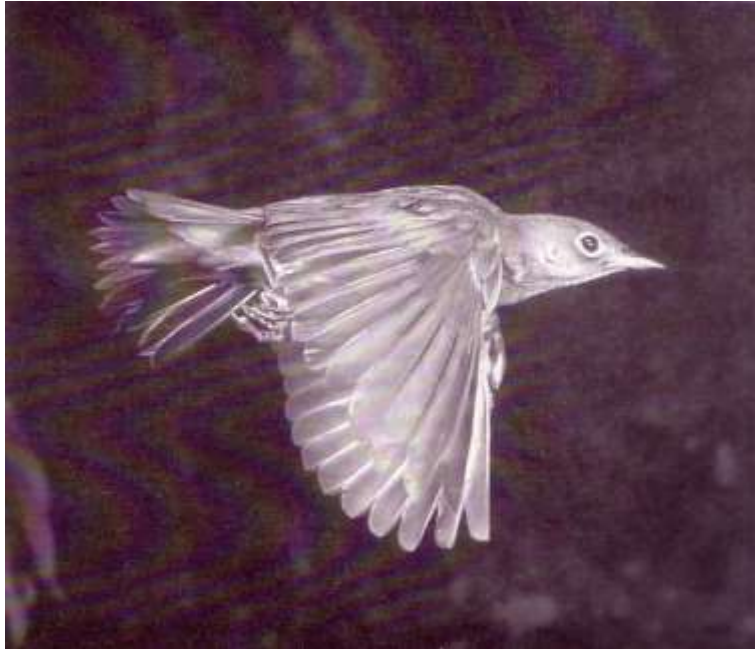
Connecticut Warbler (93-41) banded at Johnsons Bayou, Cameron Parish, Louisiana, 28 April 1993. upon release.