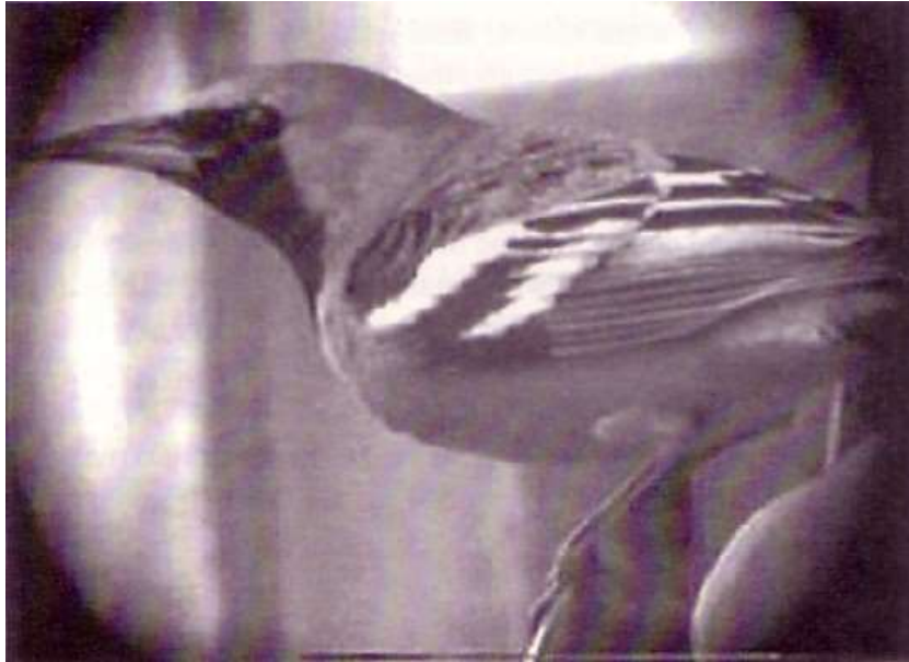
Adult male Hooded Oriole (93-61) at Baton Rouge, East baton Rouge Parish, Louisiana, 21 January-26 February 1994. Photographed through a spotting telescope by Paul E. Conover.