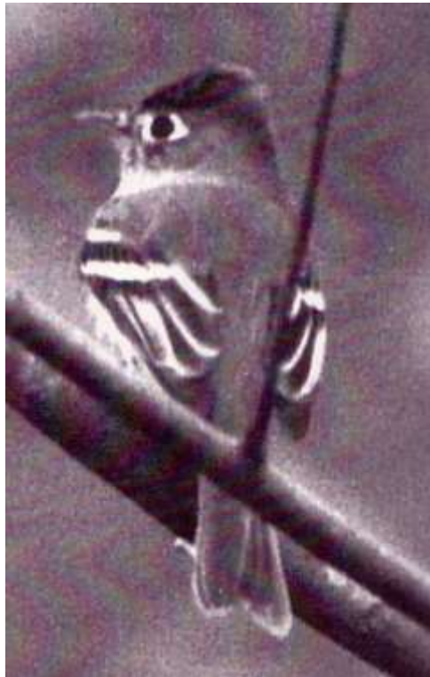
Immature male Pacific-slope Flycatcher (94-57) near junction of LA Hwys. 35 and 342, Acadia Parish, Louisiana, 21-23 December 1994.

These represent the first records for Louisiana.