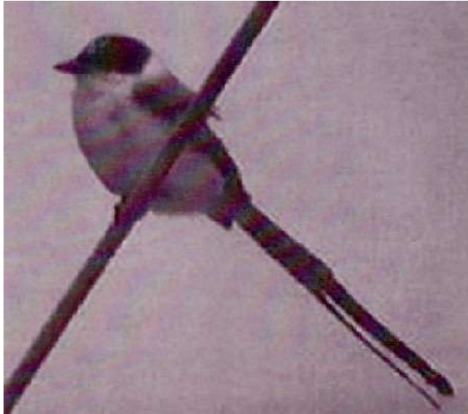
Fork-tailed Flycatcher (96-46) near Lelieux, Vermilion Parish, Louisiana, 15 November 1996.