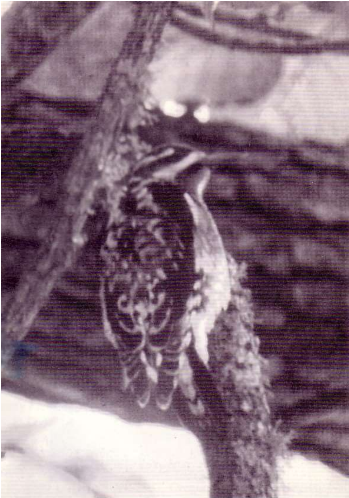
Red-naped Sapsucker (89-157), Grand Isle, Jefferson Parish, Louisiana.