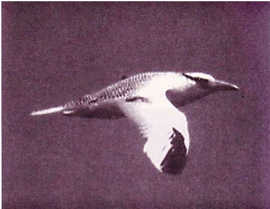
Adult Red-billed Tropicbird (96-41) at South Pass of the Mississippi River in the Gulf of Mexico, 9 June 1996.