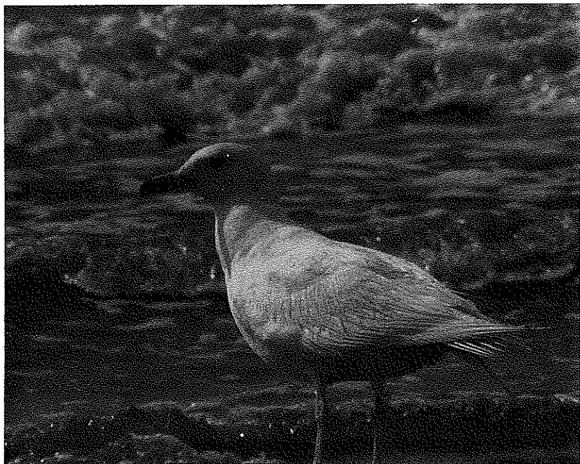
Glaucous Gull ( Larus hyperboreus ), immature, at Fourchon Beach, Lafourche Parish, April 21, 1985.

ANTILLEAN NIGHTHAWK ( Chordeiles gundlachii ). One (83-3) in New Orleans, Orleans Parish, from 27 May to 17 August 1977 and (presumably the same bird) 24 to 26 May 1978 (JR*;DP,BN, et al). Vocalizations of this bird were tape-recorded by Purrington and the tape was invaluable in documenting this record. The Antillean Nighthawk is very similar to the Common Nighthawk and was only recently recognized by the A.O.U. "Check-List Committee" as a separate species (AOU 1983). The typical "songs" of the Antillean and Common